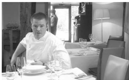
Heston Blumenthal in The Fat Duck

One question posed by Heston Blumenthal early in his career as a ‘scientific chef’ was ‘ Why do cooks add salt (sodium chloride) when cooking vegetables, for example green beans? ’ Possible reasons suggested by cooks included: