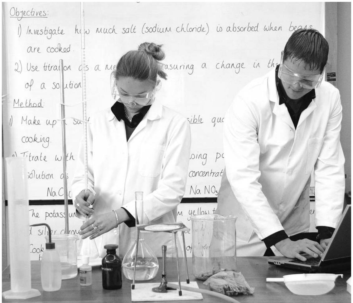
Doing the titration

Do the results suggest that salt has been transferred from the cooking water to the beans?