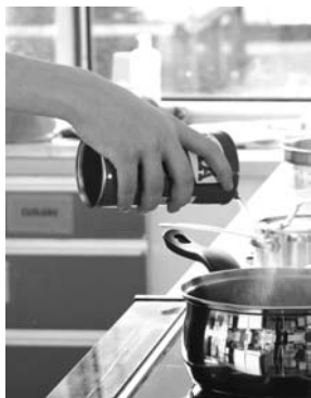
Cooking with salt