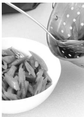
Cooking with salt