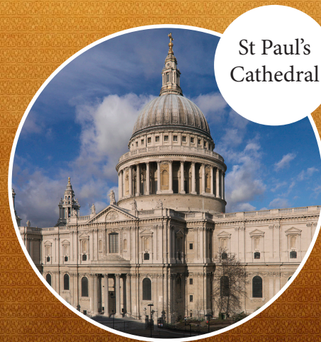
St Paul's Cathedral