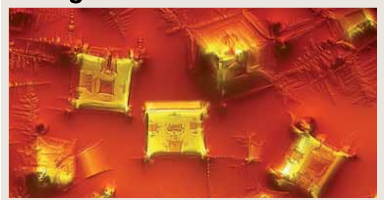
Crystallized soy sauce (x16). This image by Yanping Wang of the Beijing Language and Culture University, Beijing, China, was the tenth placed image in the 2010 Nikon Small World photomicrography competition. See www.nikonsmallworld.com