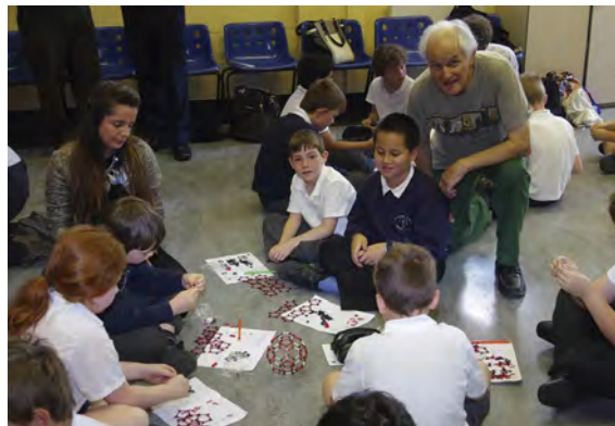
Harry Kroto making C60 buckyballs with a group of children from Didsbury C of E Primary School