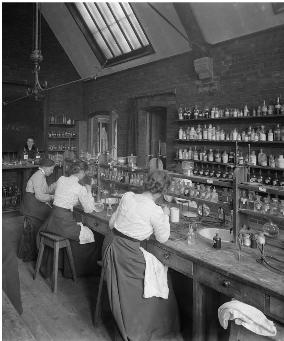
Female undergraduates at Girton College, Cambridge University, were among the lucky ones