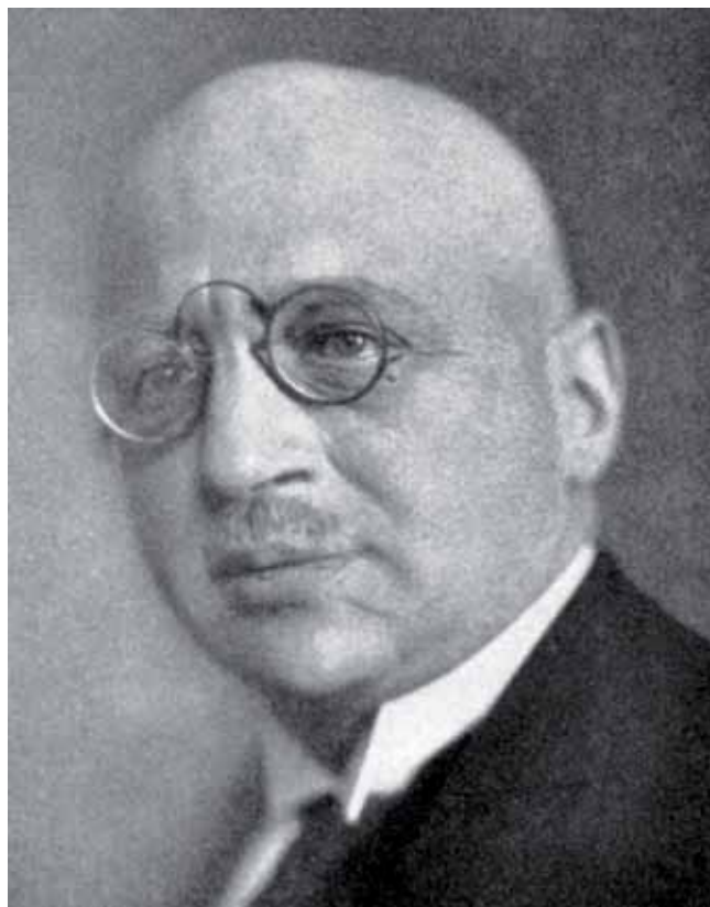
Fritz Haber won the Nobel prize for his discovery of a way to fix nitrogen

The natural nutrient cycle is most unbalanced in regions where agriculture, industry and fossil fuel consumption overlap, such as Europe and North America. But with fertiliser and energy use on the rise in the developing world, particularly in China and