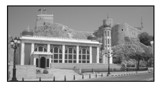
Mosque and Castle in Old Muscat

full timetable. Communicating with and getting confirmation from the companies was very difficult. Secondly, there were issues over the university providing transport. The first visit was to a company producing cooking oils, spreads etc. Our arrival was something of a shock because the works manager (who had confirmed the visit) had gone on holiday without telling anyone we were coming! The second turned out to be just a filling and packaging plant for soaps and detergents. Free samples from each place mollified the students somewhat. They were very active in taking photographs of the plant with their mobile phones (and a class photo including me) since they had to produce a report on each visit. Had my recommendations of some staff spending time in industry and building relationships with companies been implemented, then these problems would not have arisen.