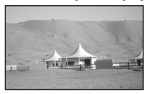
Camp in the Wahiba Sands

Having travelled extensively on previous visits this was limited largely to taking colleagues new to Oman and their families to 'see the sites', such as the old city of Muscat including the Sultan's palace, and the souk at Muttrah. A new place to see was a major coastal development called 'The Wave', which includes a harbour, many expensive apartments, a hotel, restaurants and a Greg Norman designed golf course.