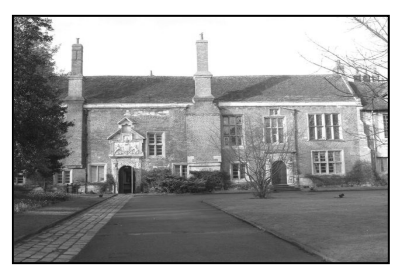
King's Manor, York

Over the last couple of years, there has been increased interest in continuous processing technology for high value, niche scale, speciality chemical manufacturing. Unlike commodity and high-volume speciality chemical manufacturing, this part of the chemicals industry has relied on the flexibility of batch manufacturing to enable a wide variety of chemical processes to be undertaken with only a minimal amount of process development and understanding as the batch reactor can cope with a great deal of uncertainty and process variability.