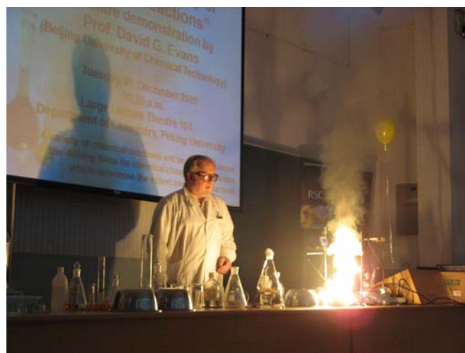
The oxidation of propan-2-ol with chromium(VI) oxide as an example of a reaction with (very!) favorable thermodynamics and kinetics.