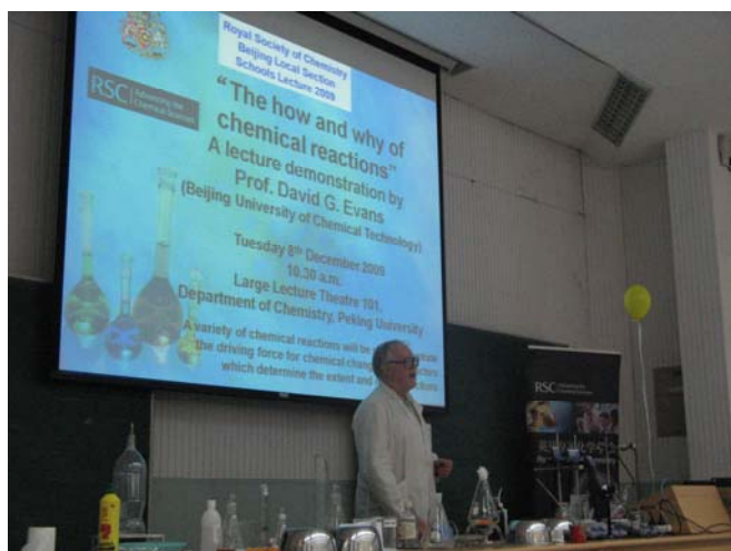
The beginning of the lecture.