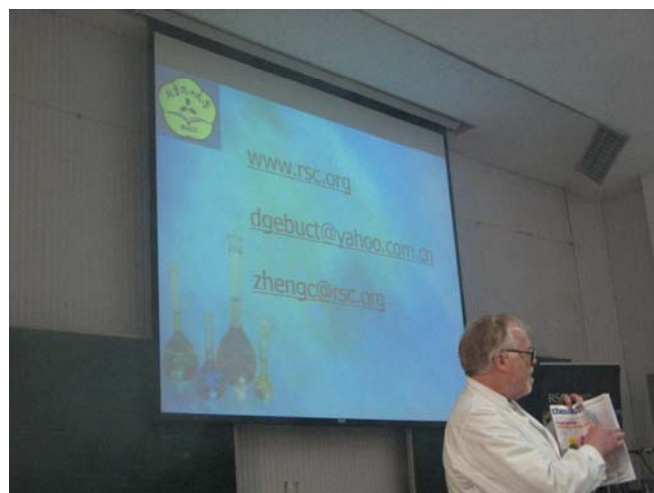
Introducing the RSC and Chemistry World China at the end of the lecture.