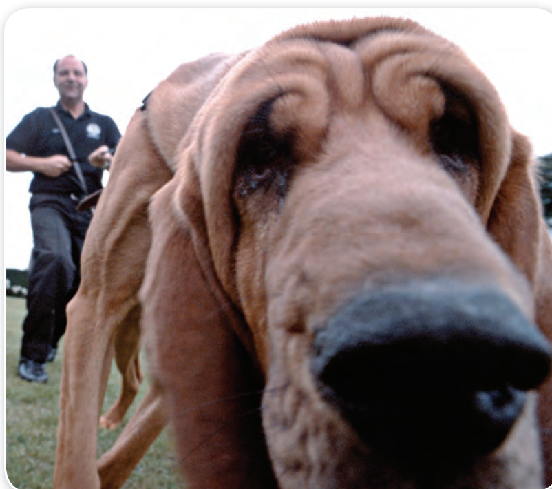
Bloodhounds make good sniffer dogs due to their incredible sense of smell