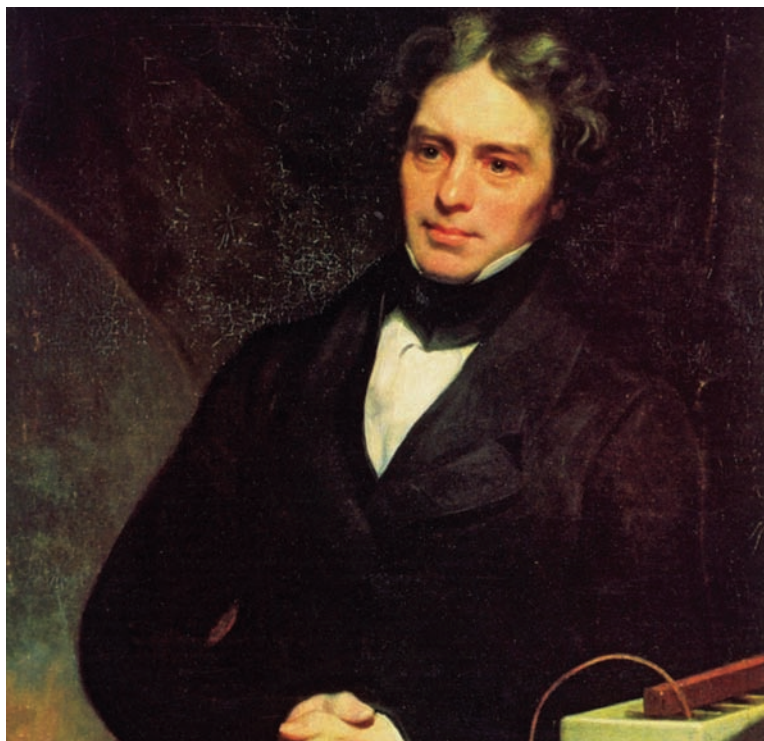
ROYAL SOCIETY OF CHEMISTRY LIBRARY AND INFORMATION CENTRE (LIC)

Michael Faraday referred to Marcet as his 'first instructress'