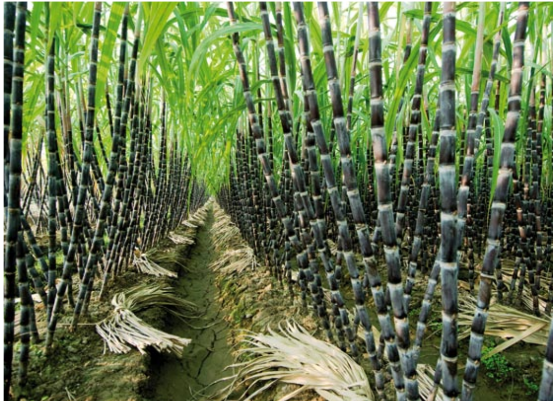
Sugar cane can fix sunlight with an efficiency of 2%, ten times the planetary average for wild plants. In Brazil it is fermented to produce ethanol, and over 50% of cars run on ethanol-based fuels.

“Countries that have large land masses may be able to grow significant amounts of biomass energy usage without competing with food production.”