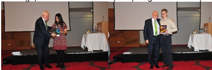
Aisha Naziran (Durham)