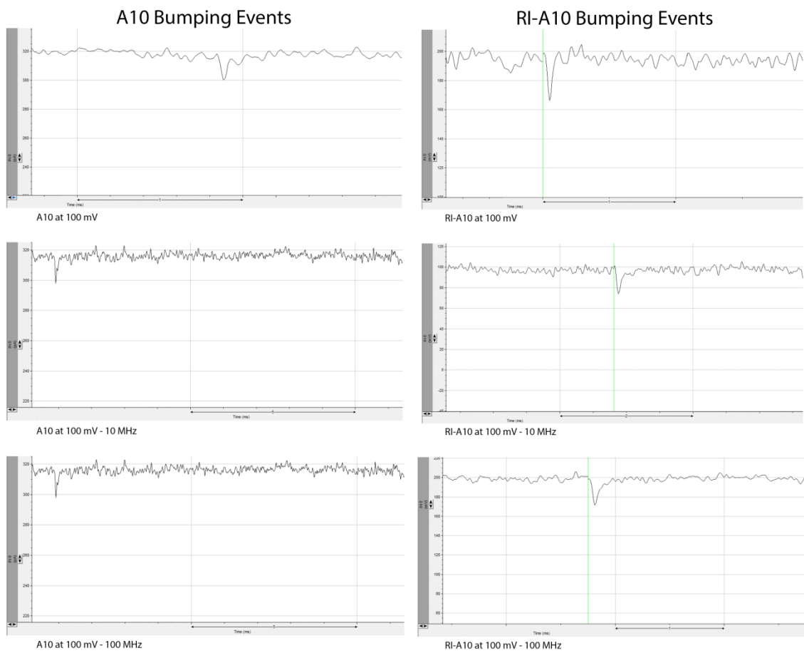
Fig 3S. Expanded screen shots for typical bumping events for A10 and RI-A10.