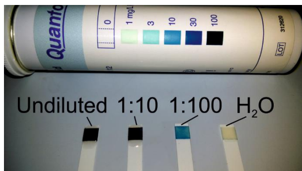
Figure S2. H 2 O 2 /oil nanoemulsion contained ~1 g/l H 2 O 2 , as determined using a 100x diluted emulsion on a quantitative peroxide color indicator strip.