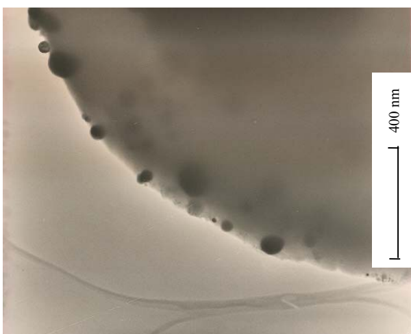
a) TEM of Pd(0)-mordenite (4 wt.% Pd), reduced by H 2 .