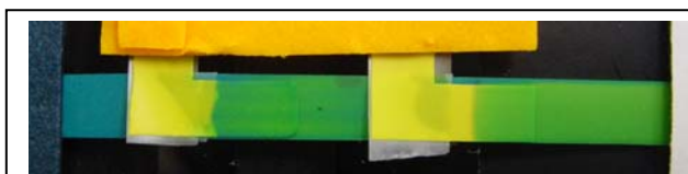
Fig S3. Serial dilution in a paper device. Left inlet contains erioglaucine and top inlets contain tartrazine.