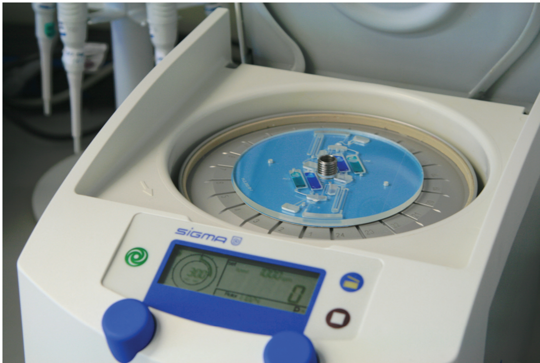
Figure 2: DNA-Extraction disk in a standard laboratory centrifuge using a haematocrite rotor to fix the substrate in place. The green glass capillary contains washing buffer 1 (AW 1), the blue capillary contains washing buffer 2 (AW 2). (buffers are colored for visualization)