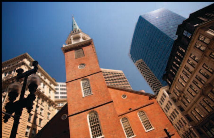
The Boston Park Plaza Hotel & Towers | Boston, MA

the essential protein engineering summit