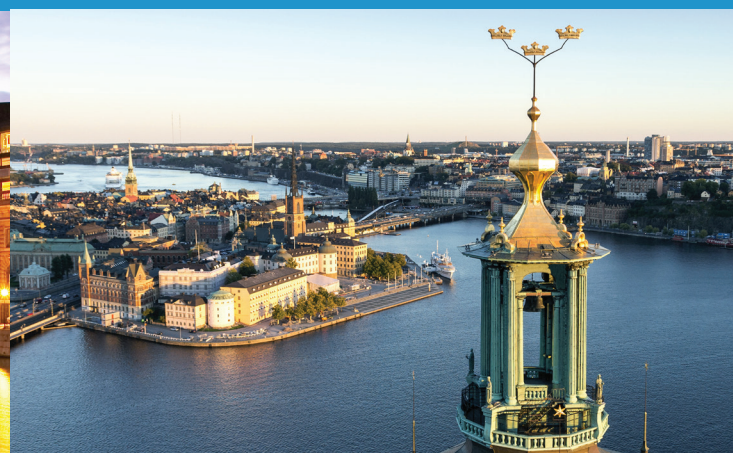
Stockholm city hall and old town.