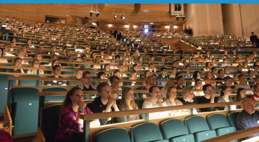
Conference venue Aula Magna.