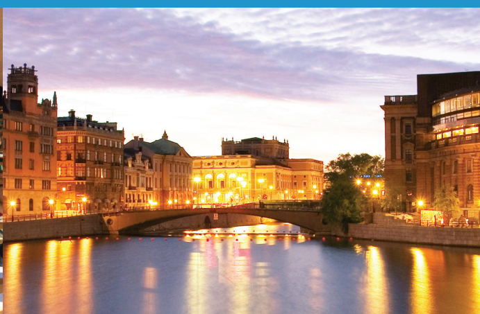
Summer night in central Stockholm.