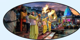
Har ki Pauri, 31 km from Roorkee