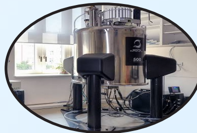
500 MHz NMR