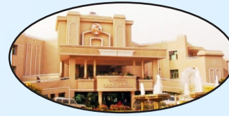
Patanjali Yogpeeth, 12 km from Roorkee