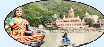
Rishikesh, 52 km from Roorkee