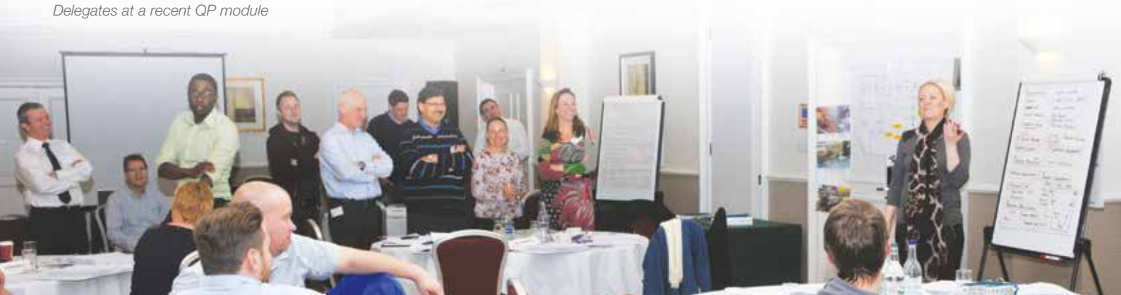
Delegates at a recent QP module

The information contained in this brochure is correct at the time of printing and is published in good faith. We reserve the right to make any changes which may become necessary.