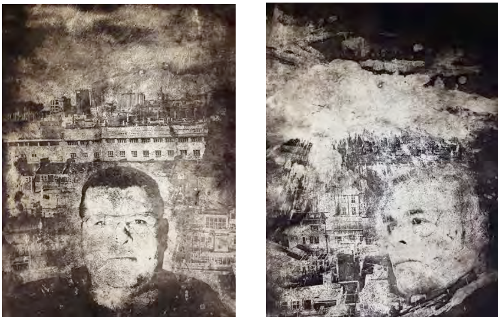
Figure 1: Portraits of demolition workers on the UCL campus acid etched into roofing zinc.