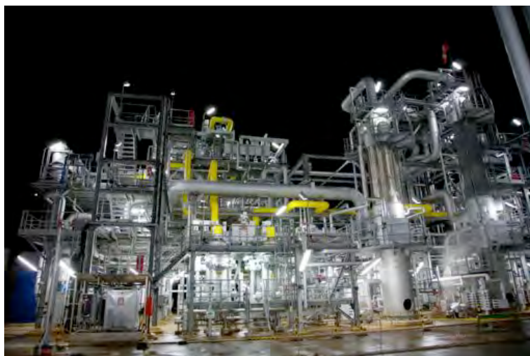
Figure 1: Claus plant of the Bayernoil refinery in Bavaria, Germany.

Most important among CFC’s patents is the one describing the production of elemental sulfur by oxidation of hydrogen sulfide with air at elevated temperatures in what has later been called a “Claus kiln” (furnace) using a metal oxide catalyst (German Patent nr. 28758, and British Patent 5958, both of 1883). Today this method (after considerable modifications [4]) is known as the “Claus process” [5]. It is applied worldwide on a large scale to process hydrogen sulfide from the desulfurization of crude oil by hydrogenation, especially in oil refineries. Figure 1 shows sections of a modern Claus plant at the refinery of Bayernoil in Bavaria.