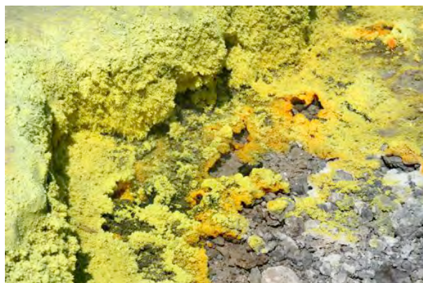
Figure 2: Sulfur deposits on the slopes of the volcano on Isola Vulcano (Italy)

In Figure 2 [10] a deposit of sulfur crystals on the island of Vulcano (Italy) is shown, formed by air-oxidation of hydrogen sulfide as a component of hot volcanic exhaust gases; the sulfur at this location is also known for its relatively high selenium content of up to 680 ppm [8]. In Figure 2 the gas vents can be recognized from the surrounding orange-red coloured sulfur which evidently is hotter than 25°C since sulfur is a thermochromic material.