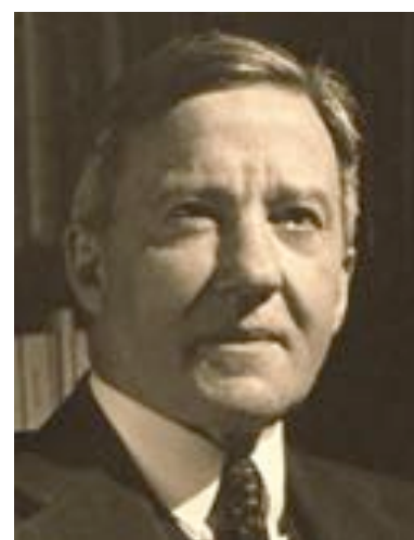
Sir Eric Rideal (1890-1974)

The UK Joint Colloids Group (JCG) is a joint working group of the Royal Society of Chemistry's Colloid and Interface Science Group and the Society of Chemical Industry's Colloid and Surface Chemistry Group. The JCG committee administers three joint RSC/SCI awards. These awards recognise and honour current outstanding researchers in the subject, at varying stages of their careers: the Thomas Graham Lecture for persons in mid-career, the McBain Medal for early-stage researchers and the Sir Eric Rideal Award and Lecture for life-time achievement.