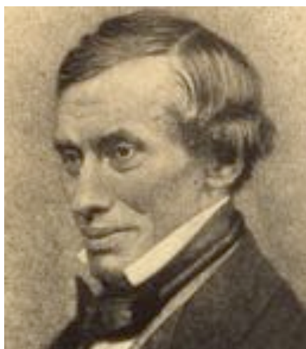
Thomas Graham (1805-1869)