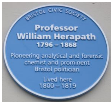
Fig. 1, The Herapath Plaque in Bristol