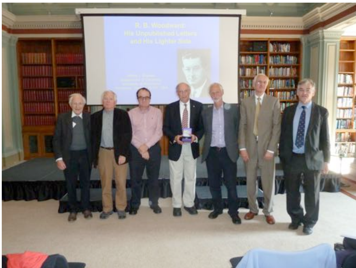
Speakers at the Woodward Meeting