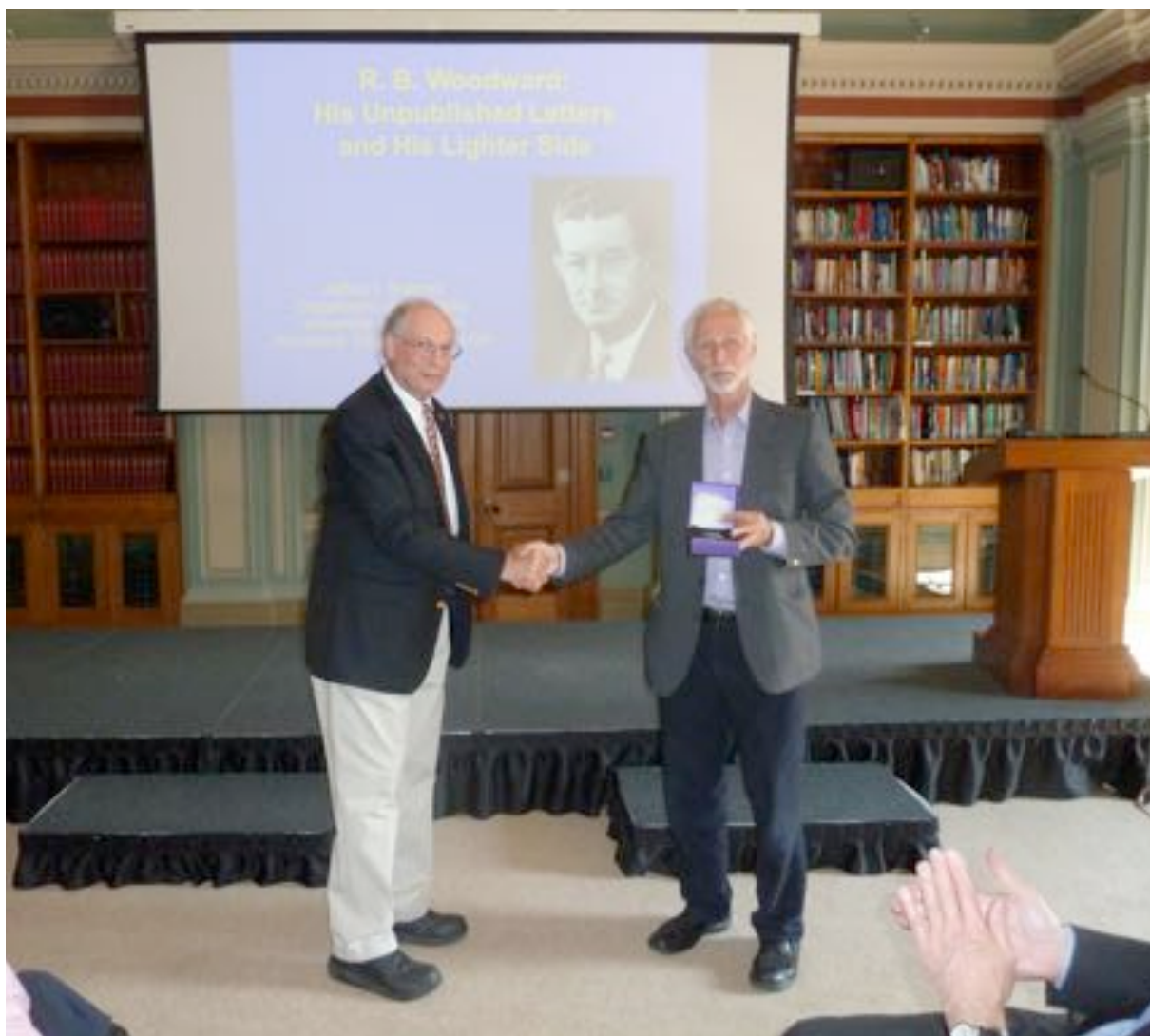
Presentation of the Wheeler Award