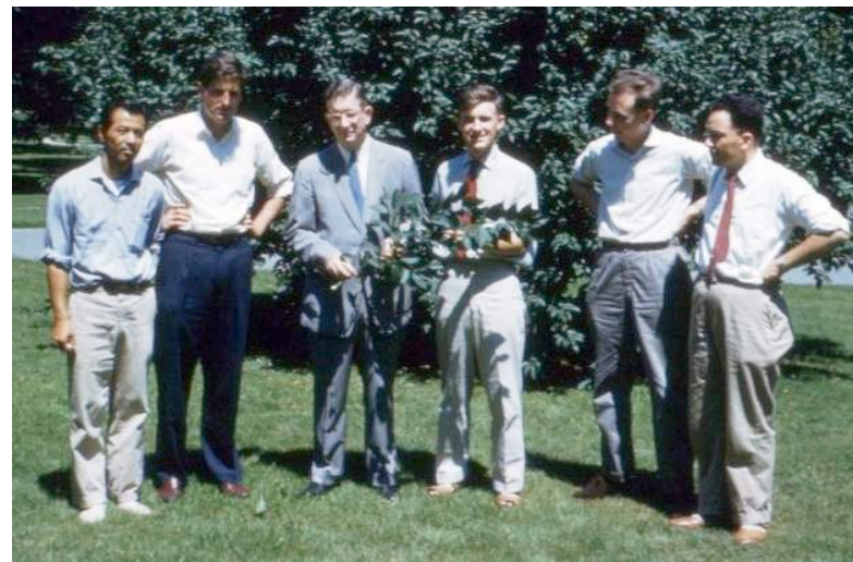
Photograph of the 1958-59 chlorophyll group, July 1959.

alternative, experimentally very elegant, but far longer and less practical route, and subsequently several other paths were laid down before the one outlined here was discovered. [26]