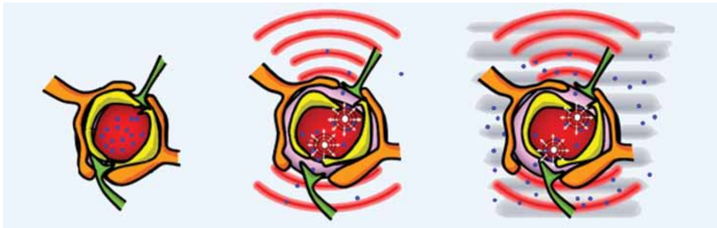
PROCEEDINGS OF THE NATIONAL ACADEMY OF SCIENCES, USA

Ljubimova believes that nanomedicine will bring about a major leap forward for cancer treatment and improve the quality