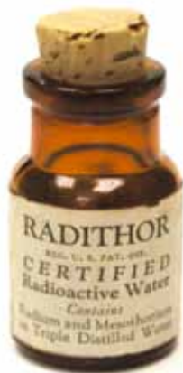
Marketed as a cure for the living dead, in 1932 one enthusiastic customer died of radium poisoning

If it was not for Marie Curie's scientific curiosity and the support for her 'blue skies' research, and the recognition of its therapeutic potential, radiotherapy might have taken decades longer to emerge as a