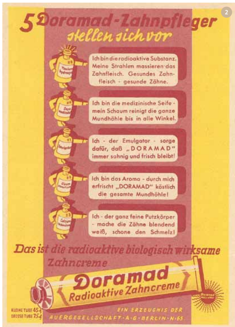
Fig 2 Radioactive toothpaste