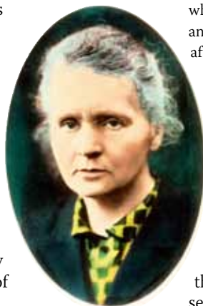
Marie Curie (1867–1934)

Furthermore, radium owns astonishing physiologic properties. An exposure of the arm to two 20 minute sessions has produced an inflammation of the skin which has now already lasted two weeks, and exhibits the same aspect as obtained after a long exposure to x-rays. 3