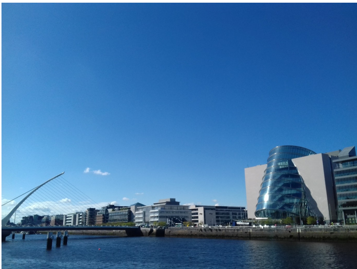
The Convention Centre (CCD), Dublin, Ireland