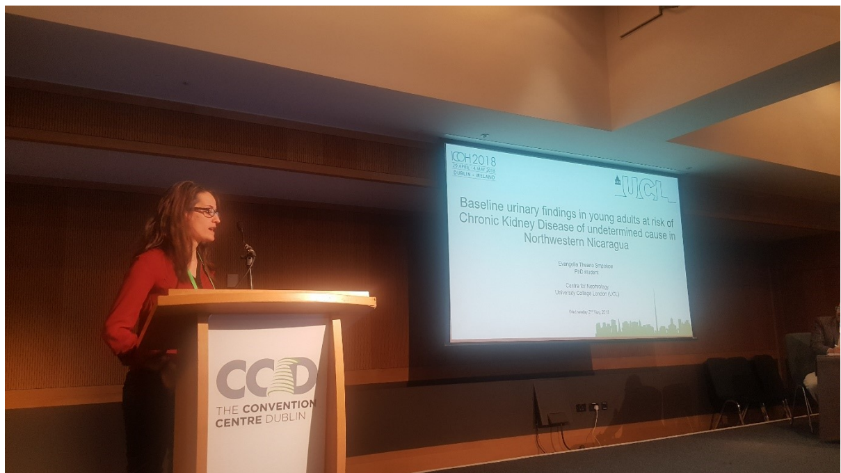
My Talk on the 2 nd of May