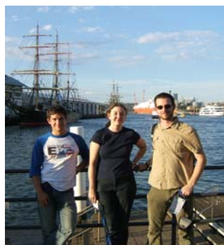
A Waiting boarding for dinner

The conference dinner took place on a sunset cruise about the harbour. The top deck was filled with scientists taking refuge from the main course and a zillion photos. On the final day of the conference awards were presented, including to one of us (RS), who had won one of four Gen Shirane memorial prizes for his poster presentation on U-Fe multilayers. We thanked the organisers for their great hospitality which ensured a successful and enjoyable meeting. As the conference ended the sun was out and we had a few days to explore the city in the pre-Christmas heat!