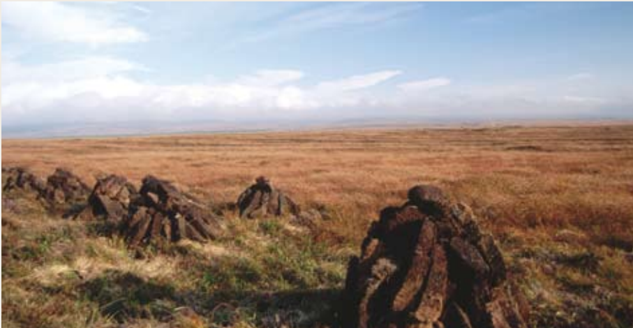
Each peat bog on Islay adds a unique flavour signature to the final whisky

All casks must be less than 700 litre capacity, because much of the maturation chemistry depends on good contact with the wood. Three types of reaction happen in the cask – additive, subtractive and interactive. In subtractive reactions, compounds are lost through the timber – including the