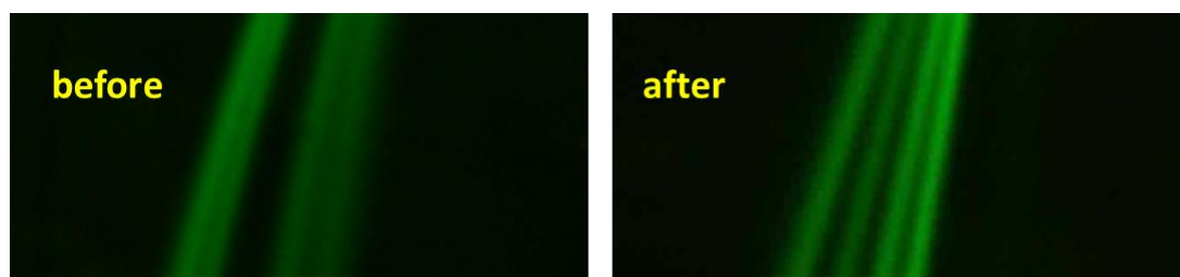
Figure 3 Comparison of Fluorescence images before / after coating