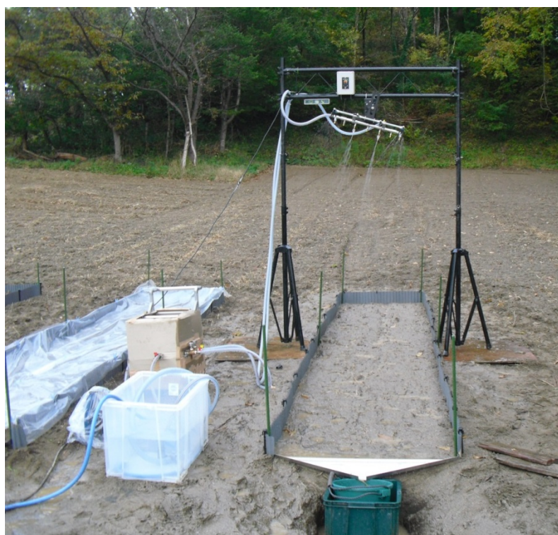
1 Figure S1. Photographs of the experimental setup 2