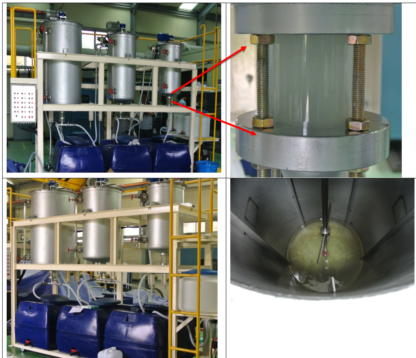
Supplementary Fig. 1: Pilot plant view of batch process ITO etching industry wastewater treatment plant: (a) and (c) view of plant, (b) transparent window to watch liquid-liquid separation, and (d) inside view of the baffle mixture reactor.