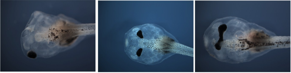
Supplementary Figure 2: Examples of craniofacial defects observed for \alpha -tubulin-T56I-injected embryos