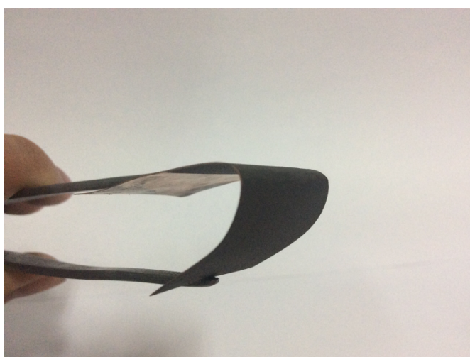
Fig. S1 Optical image of \text{Co}_3\text{O}_4 @graphene-2 hybrid films deposited on copper foil under bending.

Fax: +86-10-82317103; Tel: +86-10-82317103; E-mail: songmei_li@buaa.edu.cn