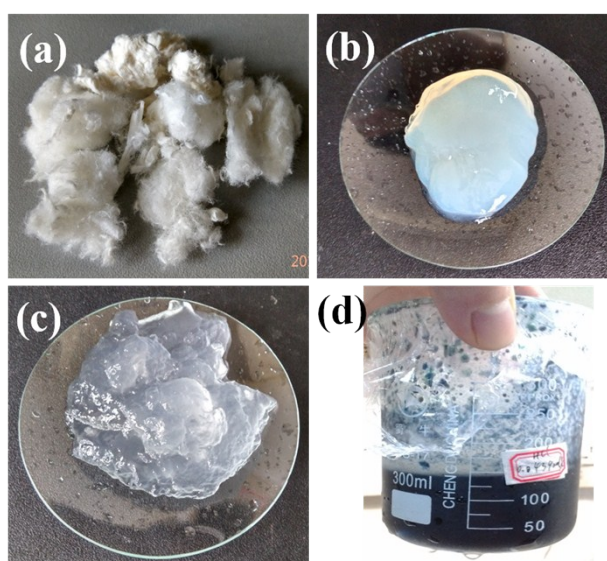
Figure S1. The digital photograph of raw materials and byproduct: (a) sisal pulp, (b) CNC, (c) CNF, (d) CNC@PANI.