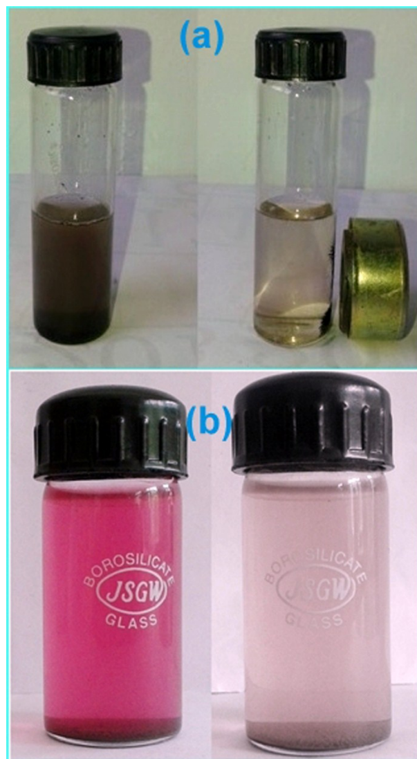
Fig S1: Digital photographs of magnetic separation and decolorisation of DPC-Cr(VI)