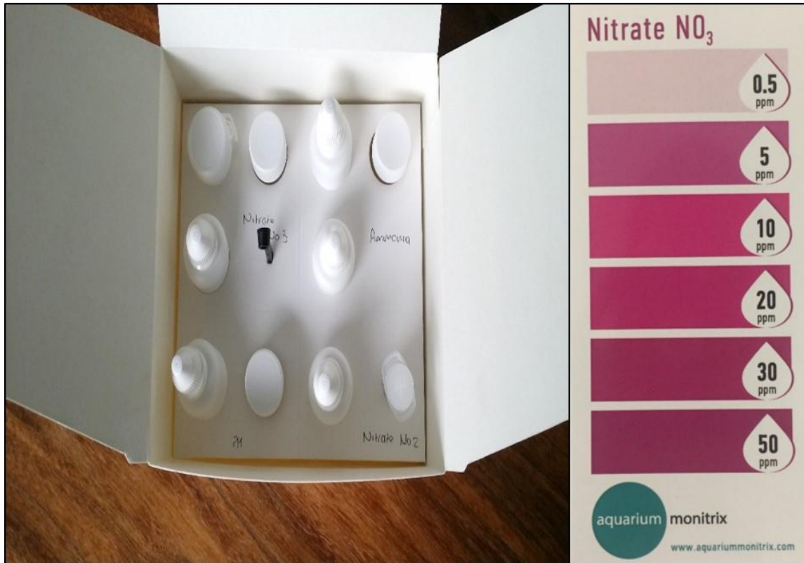
Figure B: Potential packaging design and nitrate concentration colour chart