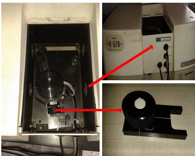
S1: The integrated sphere unit in the UV-Vis-NIR-scanning spectrophotometer (JASCO V-570 spectrophotometer, Japan)