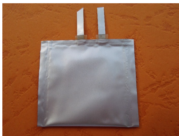
Fig. S2 Photograph of the pouch cell for OCV test