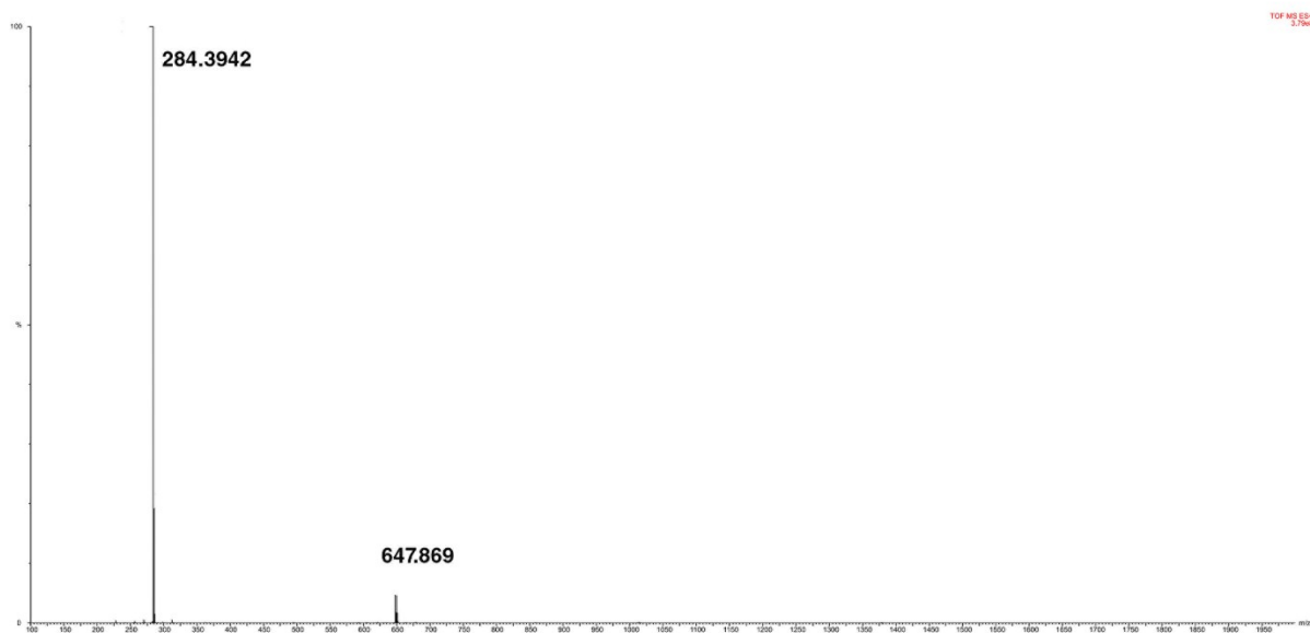
Figure S2: General positive ESI-mass spectrum of the seeds solution, at 5 min, after precipitation of the CTAB excess.