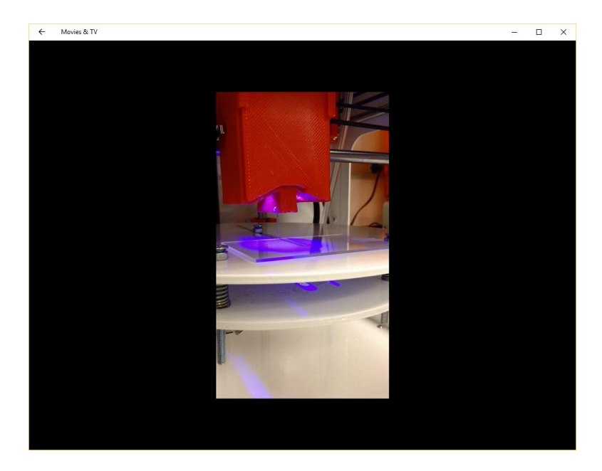
Supplementary Movie S1 Video showing the bioprinting process for fabricating the sacrificial Pluronic scaffold.