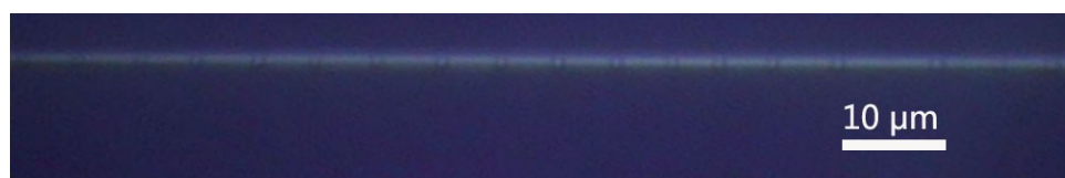
Figure S2. A typical bright-field optical image of the CdS/CdS:SnS 2 superlattice wire.