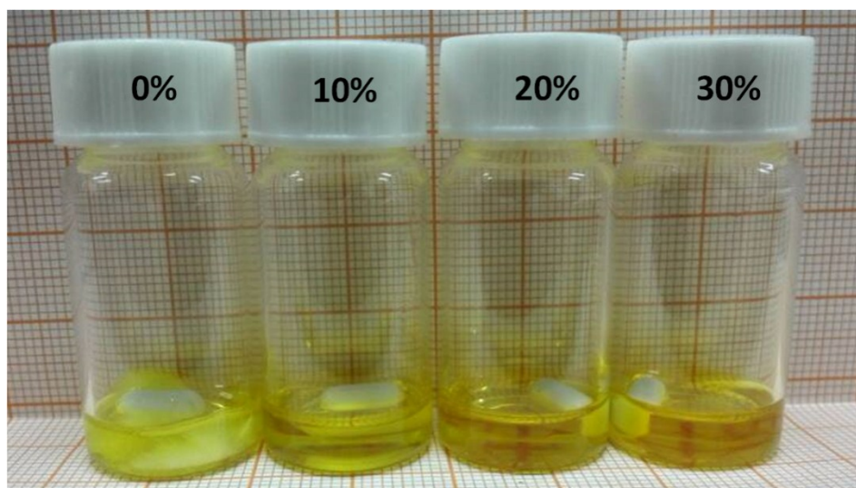
Figure S2. Photographs of PbI 2 /DMF solutions with different concentrations of NMP.