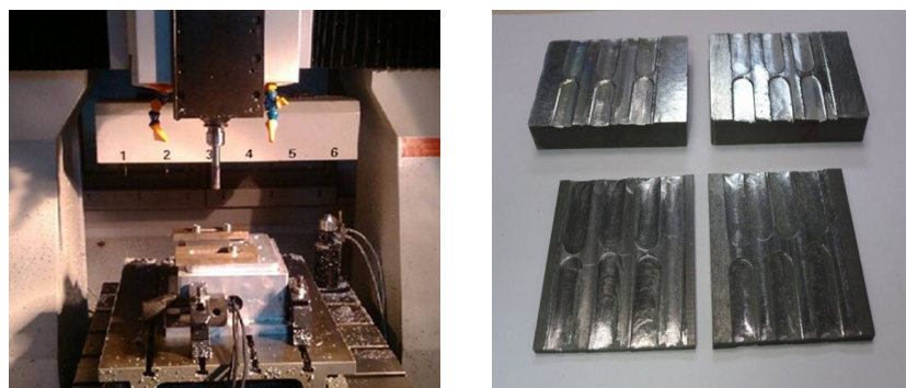
Fig. S1 Set up used for milling and cutting force testing of the SiC particles workpiece

Qiong Wu a , Yu Si a , Guang-Sheng Wang a* and Lei Wang b*