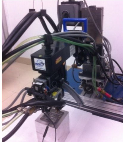
Fig.S3 Experimental setup of the X-ray stress detector used for measuring the residual stress in SiCp/Al milled under different cutting parameters