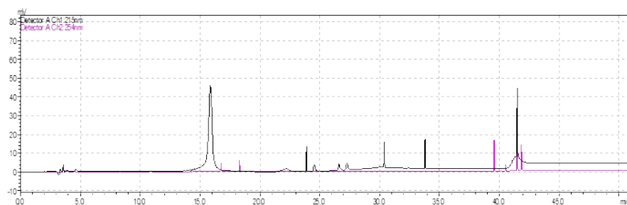
Fig. S3 HPLC figure of 5g/L product isolated from Streptomyces sp. DES20 with \text{NH}_4\text{OH} elution