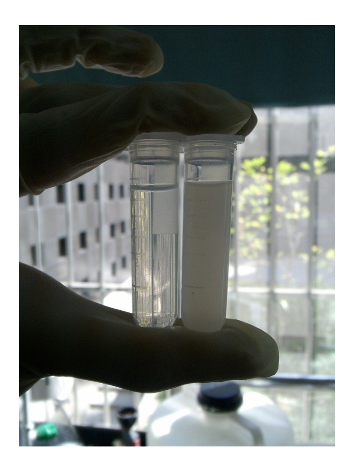
Fig. S2 Digital camera image of the sample C2 (left) and P25 (right) after an ultrasonic treatment.