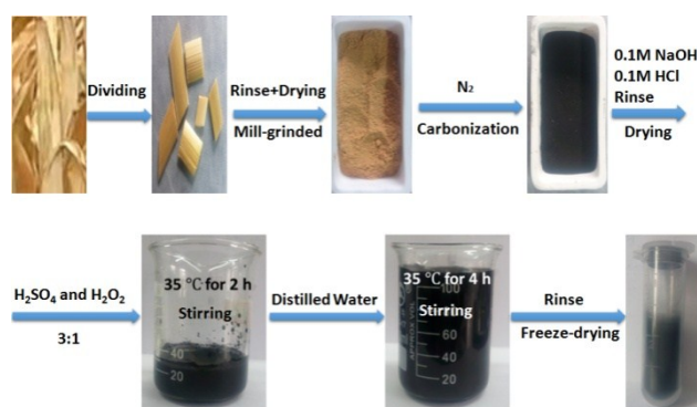
Figure S1 Synthesis schematic of corn stalk derived carbon