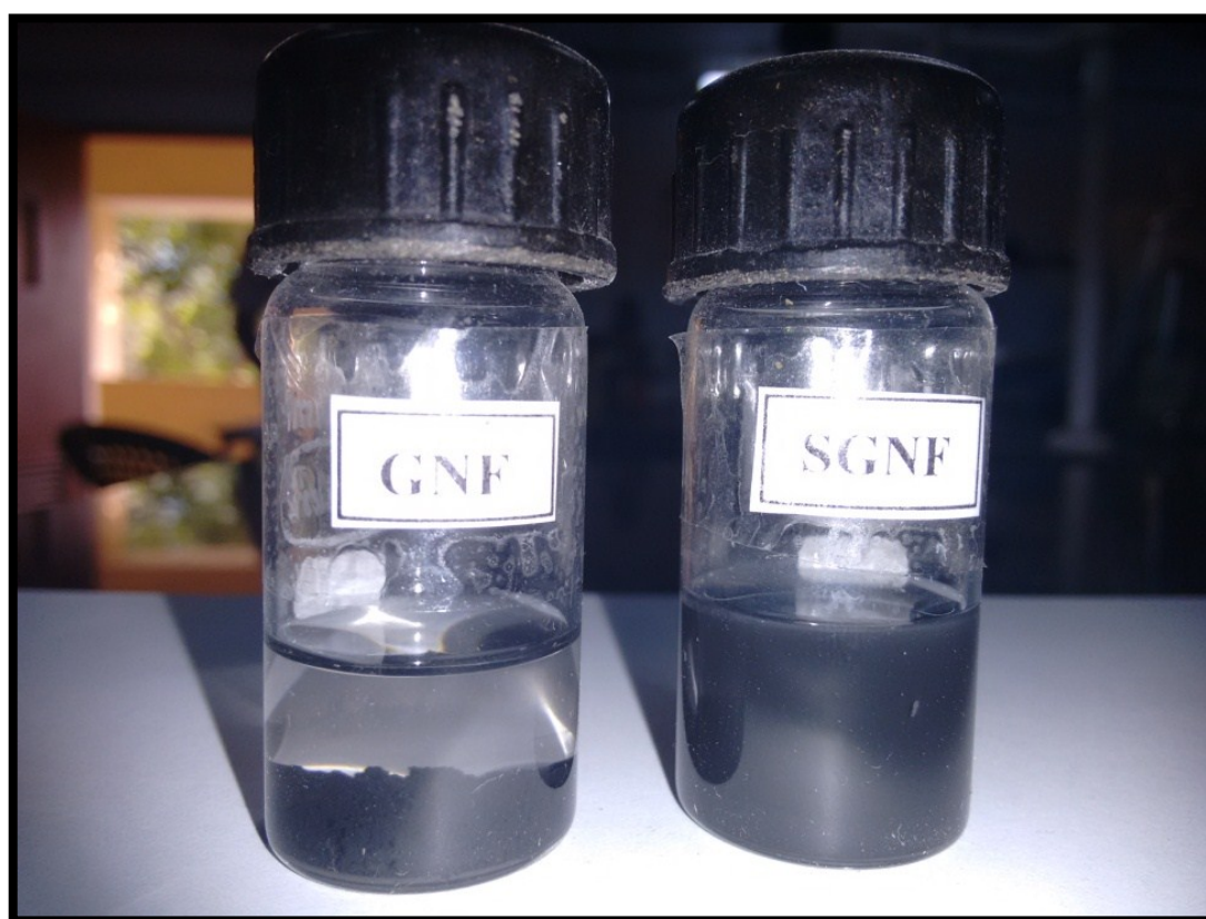
Fig. S1. Dispersion of GNF and SGNF in water