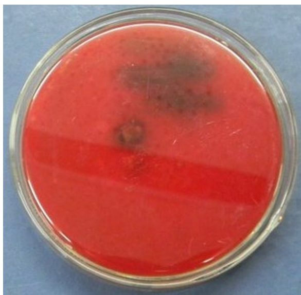
Fig. S2 Haemolytic activity of Bacillus stratosphericus A15 culture on blood agar media.